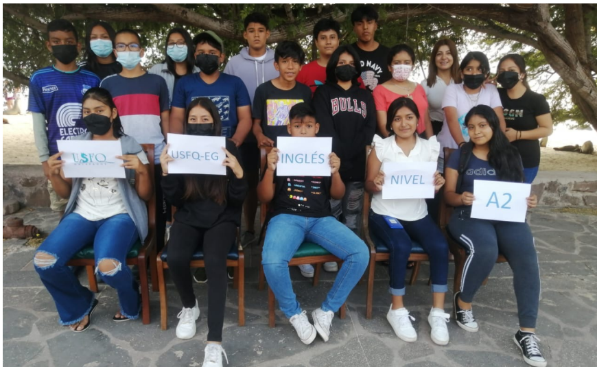
FIGURE 3. Students from the A2 English class for young teenagers, academic year 2022-2023