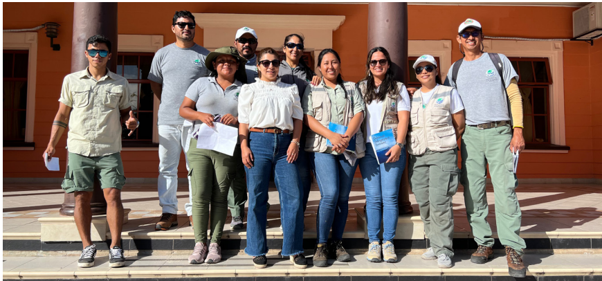
FIGURE 1. Employees of the Galapagos National Park during the bespoke short course "Communicative English through Language Functions"

As such, through a focus on communicative learning outcomes embodied by language functions, our short language courses are able to deliver tailored learning designed to meet the specific needs of particular student groups.