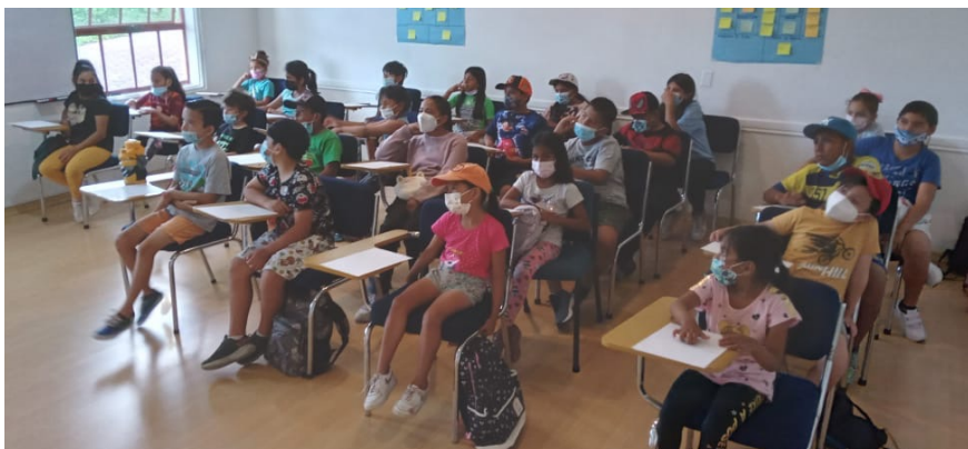
FIGURE 2. "Rediscovering the World" summer course for kids, March 2022

Another example of bespoke course design is provided by the tailoring of our 2022 summer course for children to help them accustom themselves to face-to-face classes for the first time since the Covid-19 pandemic began. We named the course "Rediscovering the World" and combined ESL learning with collaborative activities and games specifically designed to help children with their social reintegration (Figure 2). For many participants, this was their first face-to-face learning experience in two years. For this reason, special emphasis was placed on the "Socializing" language functions.