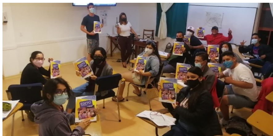
FIGURE 4. USFQ Galapagos French language students on the first day of their learning journey in September 2021

USFQ Galapagos' eight-month French as a Foreign Language program used the creation of products as assessments of the attainment of learning outcomes. From the very beginning of the program, students learned by generating products and using their creativity. To do this, students worked with real documents and adapted them to their specific context, paying attention to the special characteristics of the Enchanted Islands. Students made TikTok videos describing the Galapagos' fauna, presented weather broadcasts, and held interviews with native French speakers to talk about the islands. They even created a webpage called Blog Français Galápagos with important information about the islands' wildlife, including animal names in Spanish and French, scientific names, origin, food, predators, and where to find them. As they worked on interdisciplinary projects which connected their learning to the richness of the Galapagos context, students were motivated by processes for language acquisition and their new capacity to use French in their daily lives.