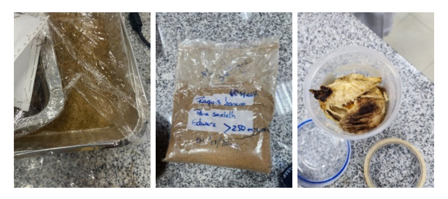
FIGURE 1. African palm rachis, banana rachis, mango endocarp (left to right)

The locally available fibers that could be used in concrete mixes to explore the influence on the mechanical properties are: African palm rachis, banana rachis, mango endocarp, brewer's spent grain (BSG), rice husk, and cacao pod husk. These are shown in Figures 1 and 2.