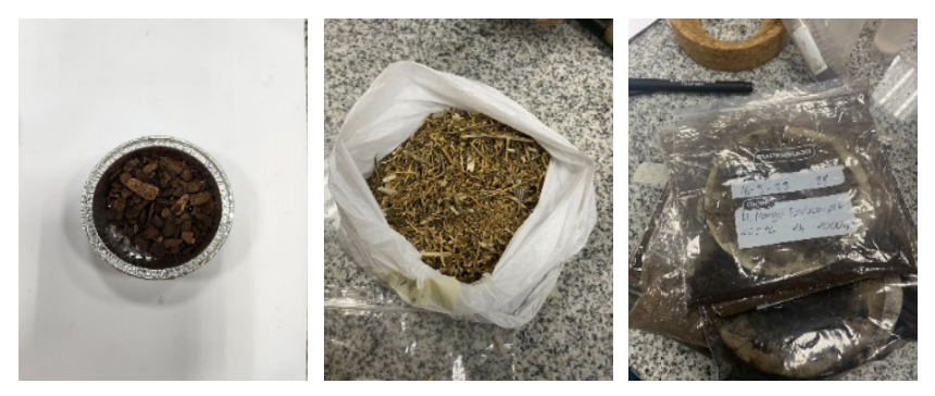
FIGURE 3. Banana biochar, rose plantation residue, mango endocarp hydrochar (left to right)

used to make rice husk ash. The materials available at USFQ at the moment of doing the inventory are shown in Figure 3.