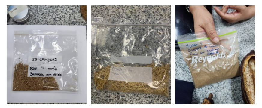
FIGURE 2. BSG, rice husk, cacao pod husk (left to right)

Potential bio-based aggregates locally available are quinoa residue, banana biochar, rose plantation residue, and hydrochar made from mango endocarp, rice husk, blackberry residue, moringa peel, and cacao pod. For instance, these raw materials can be of great use for nanocellulose which produces so-called smart materials [11]. In turn, nanocellulose can be implemented in concrete mixes for improved physical and mechanical properties as well as self-healing abilities. In terms of bio-based ash products that can be used as a supplementary cementitious material, rice husk can be