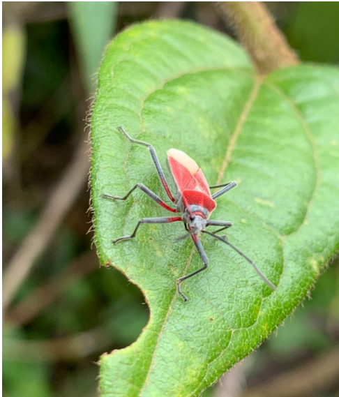
FIGURE 1. First photographs of Stenomacra tungurahuana Brailovsky and Mayorga, 1997 showing its colouration in life; San Isidro Lodge, province of Napo, Republic of Ecuador.