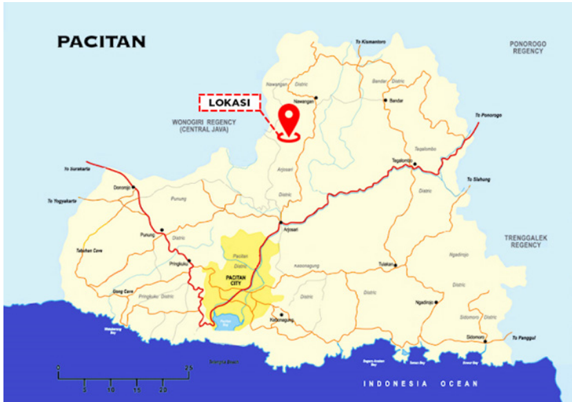
FIGURE 1. Map of the region of Tukul Irrigation

The construction of Tukul irrigation will definitely affect the surrounding region, which is Pacitan Regency. The area of Pacitan Regency is 1389.87 km 2 and consists of dry land with an area of 1259.72 km 2 and a rice field area of 130.15 km 2 . Pacitan is divided into 12 sub-districts, five urban villages, and 166 villages. The topography of Pacitan Regency consists of hills, mountains, and steep ravines, as well as Seribu mountain. Pacitan Regency shares borders on the north with Ponorogo Regency and Wonogiri Regency, on the east with Trenggalek Regency, on the south with the Indian Ocean, and on the west with Wonogiri Regency.