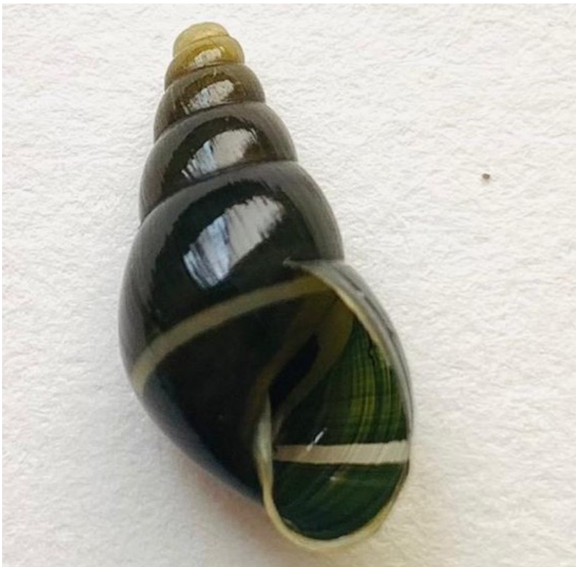
Figure 1. Specimen of Zoniferella vespera from Otonga Reserve, province of Cotopaxi, Ecuador, deposited at the Museo de Zoología (ZSFQ), Universidad San Francisco de Quito USFQ.

Herein, we present new distributional records of Zoniferella in Ecuador, expanding its range across northwestern Ecuador, providing the first descriptions of its morphological and colouration variation, and commenting on the taxonomy of the genus.