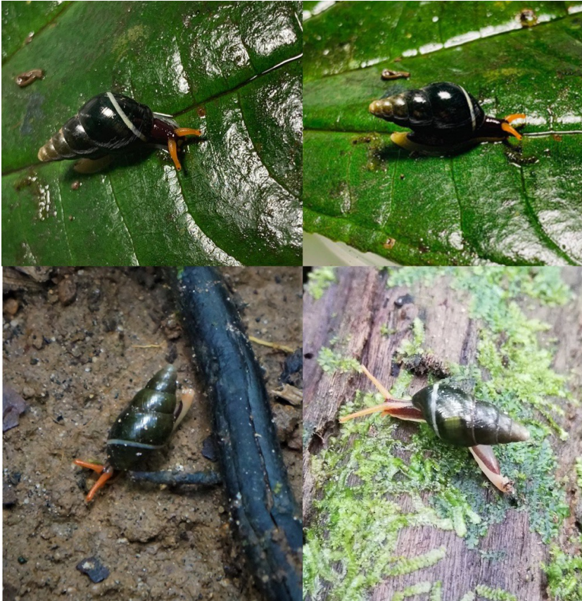
Figure 2. Variation of colouration in life of Zoniferella vespera. Top: Otonga Reserve, province of Cotopaxi, Ecuador, Bottom left: Un Poco de Chocó Reserva, Pachijal, province of Pichincha, Ecuador, Bottom right: Estación Mindo USFQ, province of Pichincha, Ecuador