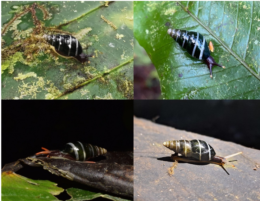
Figure 4. Variation of colouration in life of Zoniferella riveti var. bizonalis / Z. bicingulata . Photos by Barna Takats (top left), Seth Ames (top right), Ben Stegenga (bottom left), Eduardo Obando (bottom right), iNaturalist (CC-BY-NC).

Photographs reported in iNaturalist of individuals with two bands on the last whorl ( Z. riveti var. bizonalis / Z. bicingulata ) usually differ by having the tentacles completely dark like the dorsal surfaces of foot and head, except for the eyes that are cream (Fig. 4). However, one individual showing two bands has the same colouration described for Z. vespera [32]. Another has tentacles completely cream-coloured and a whitish band running towards the back from the base to each tentacle [33] (Fig. 4).